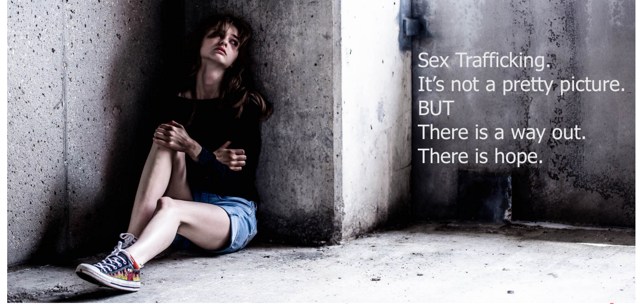
What can you do to help? So glad you asked!